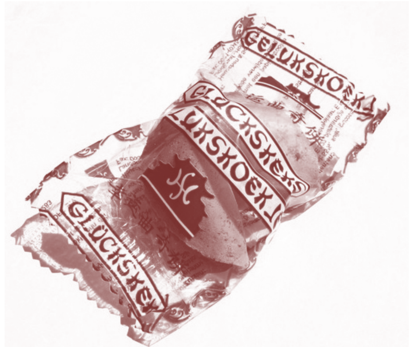
In some Chinese restaurants you get this as a present for your visit. But fortune cookies are also used as a business-present. And they put sentences in which fits good with the company.