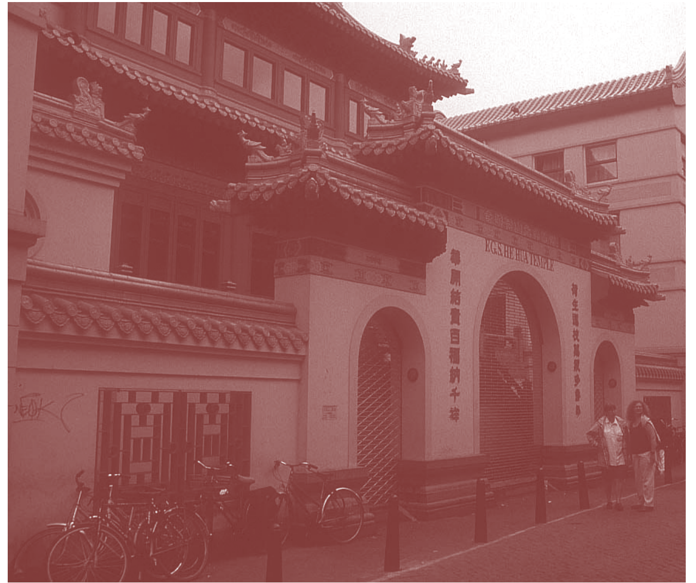
In Amsterdam we have like a little China. It's called China Town. There are a lot of Chinese stores and restaurants. There are even a few buildings that are very much the same as in China I think.