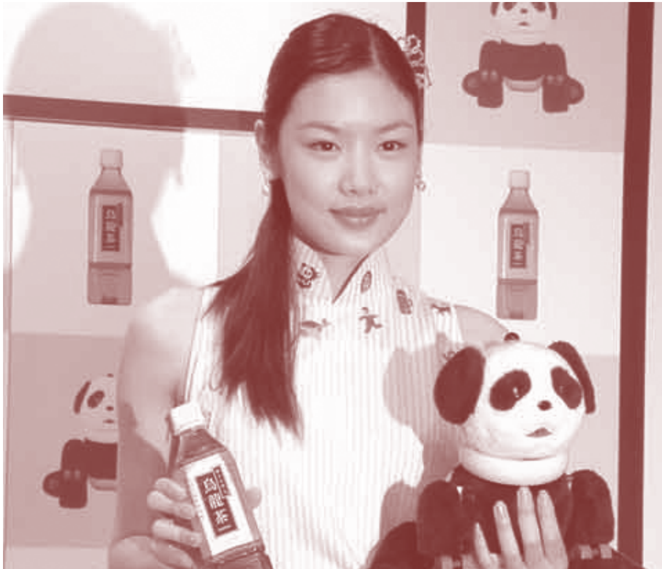
This is the ideal image of china inputted in my mind through TV commercial. Beverage company Suntory is well known for its Oolong tea, so called “weight-loss tea” in Japan. (That’s why chinese people are so skinny as we believe) In the TV commercial, always skinny, innocent chinese girl dances or what- ever, with beautiful chinese scenery.