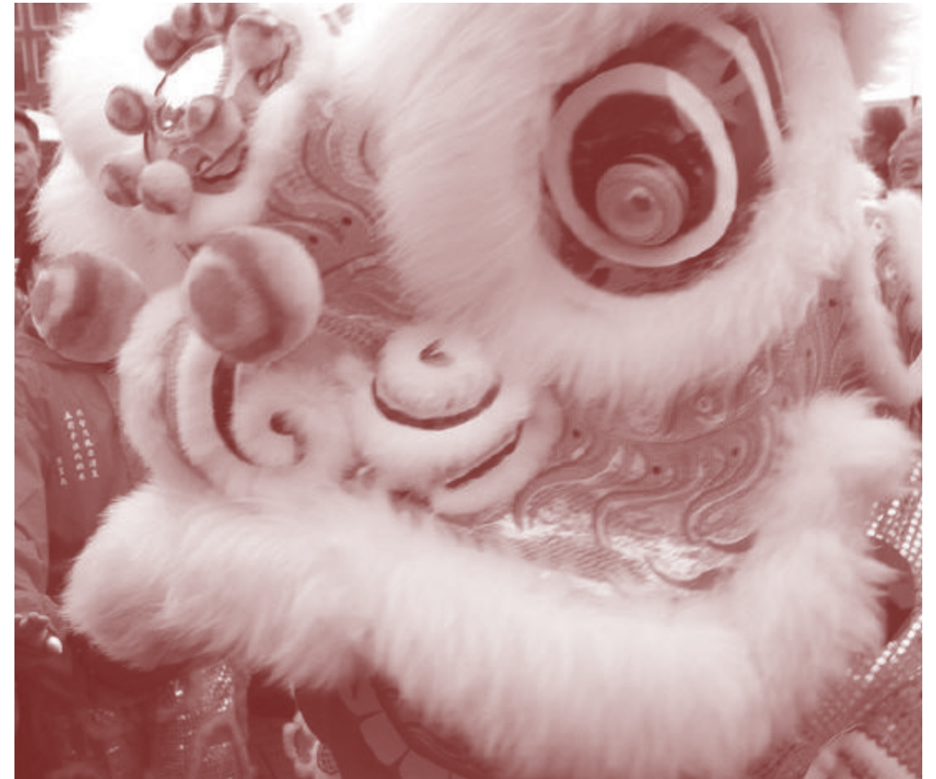
A few weeks after our new-year, the Chinese people are celebrating their new year. You can’t really ignore it because at the Chinese restaurants (and there are a lot in Holland) they are shooting fireworks and the streets are turning red from it.