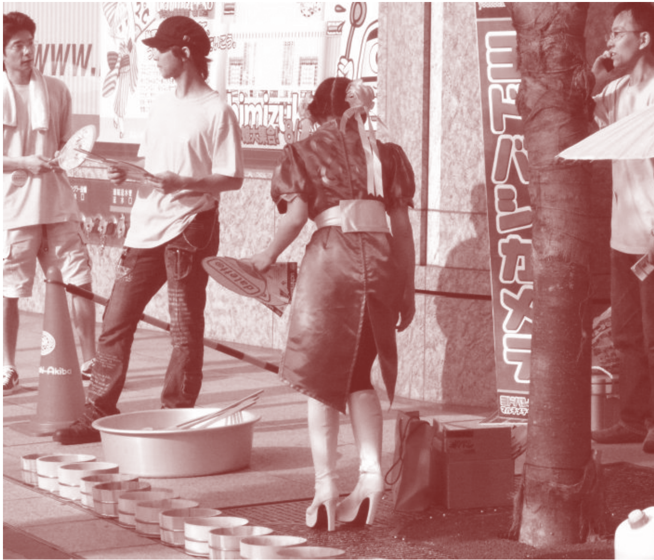
The girl in the blue chinese dress follows the style of the Japanese game character from “Street fighter”. You can see strange combination of east and west, you would never see this in China.